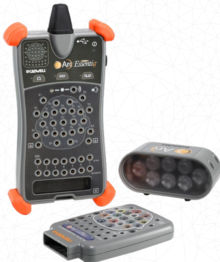
Arc Essentia Amplifier, Arc Remote Input Box, and Arc Photic Stimulator.