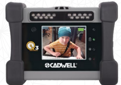
Q-Video Mobile 3 (QVM3)