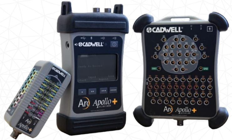
Arc Apollo+ 32-Channel Amplifier, Arc Apollo+ Recorder, and Arc Apollo+ 64-Channel Amplifier are rugged, drop-tested, and IP22 water-resistant.